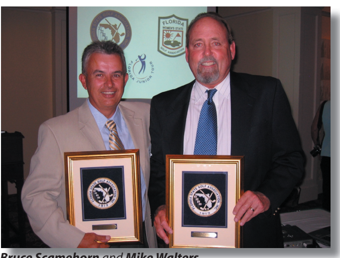
For more on the Players-of-the-Year, see page 2